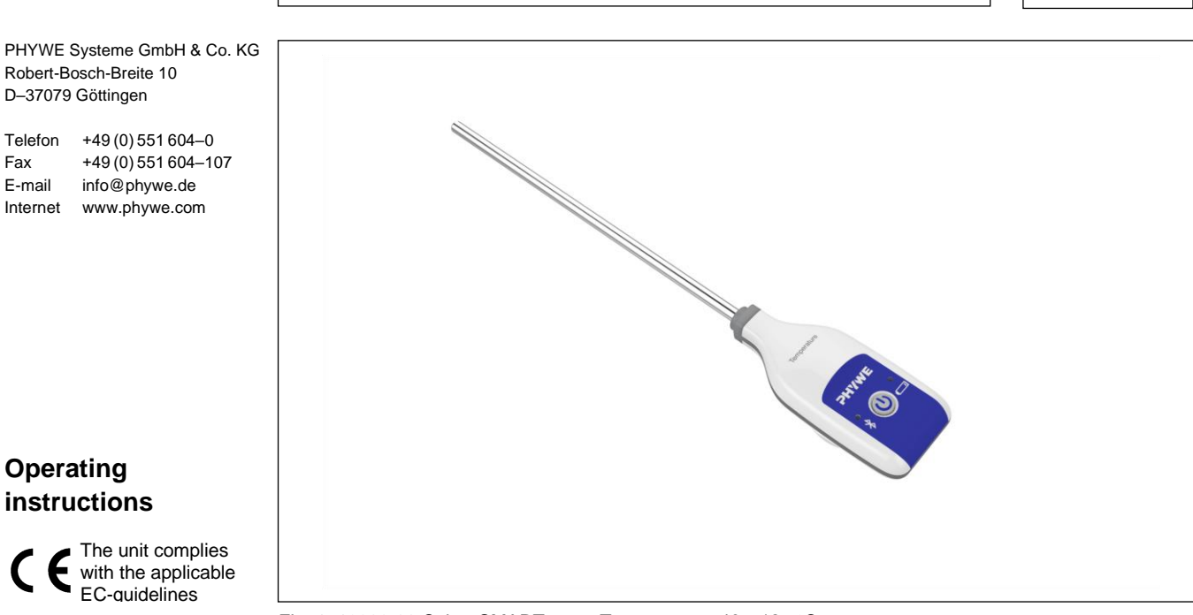
Fig. 1: 12903-00 Cobra SMARTsense Temperature -40...125 °C