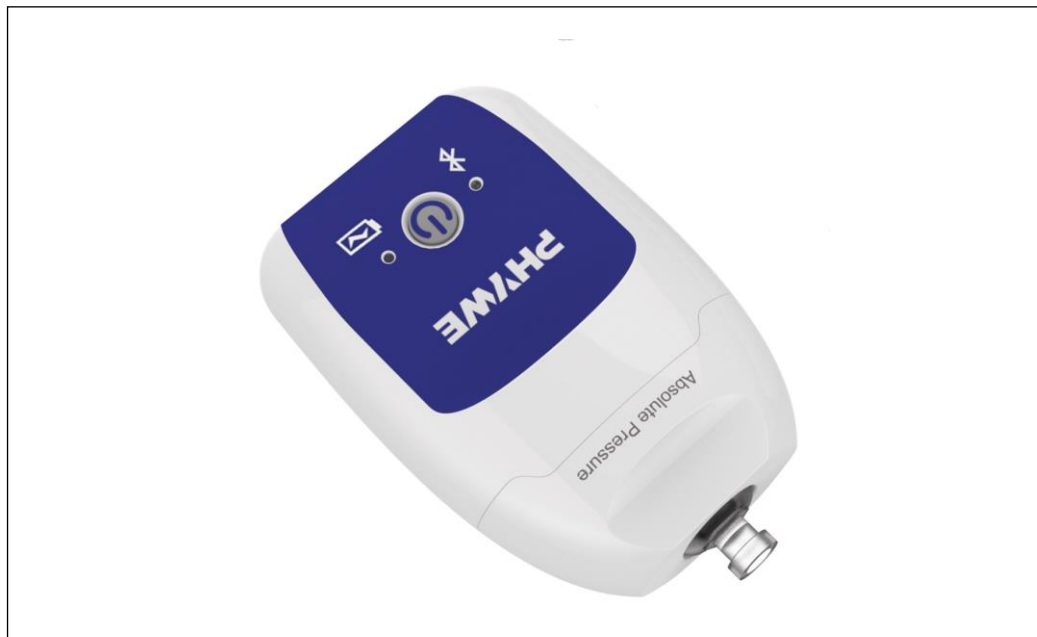
Fig. 1: 12905-01 Cobra SMARTsense Pressure 0... 400 kPa