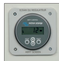
Controller screen attached to the side of the cabinet

Indoor (halogen fixed to the frame) or outdoor use.