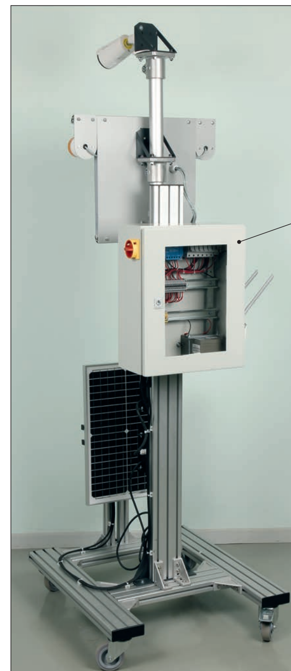
30Wp monocrystalline panel swivel for use interior with the 2 projectors supplied, outdoor with a natural solar source.