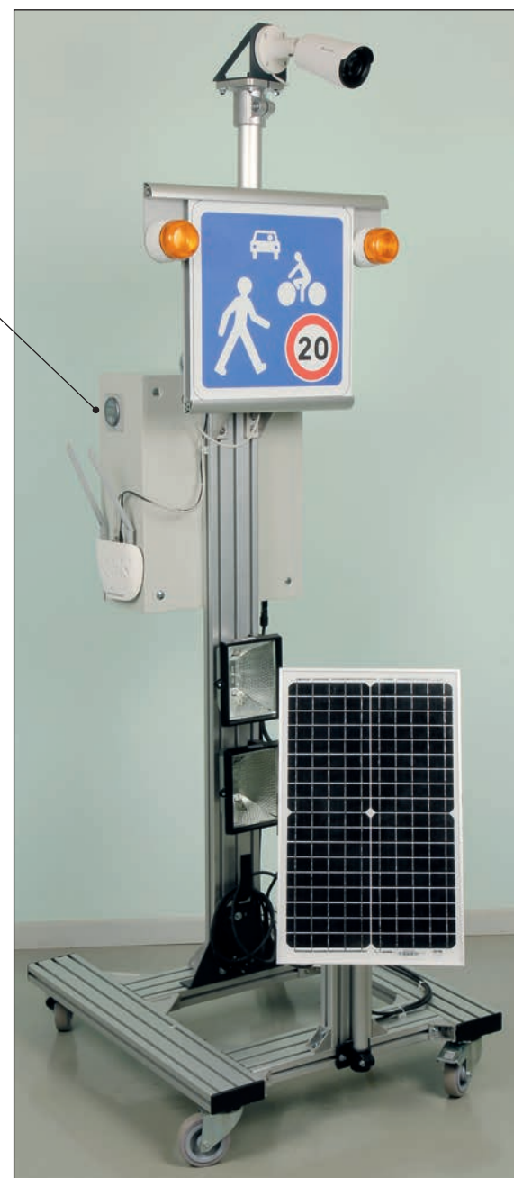
Dim : 710 x 800 x 1800mm. Weight: 60kg.