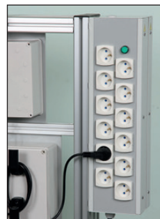
Sockets on the back of the console for connecting the modules